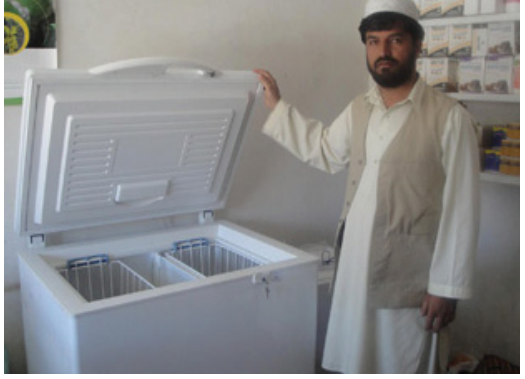
Hospital , Afghanistan